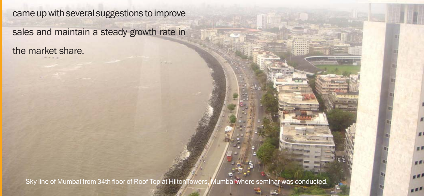
Sky line of Mumbai from 34th floor of Roof Top at Hilton Towers. Mumbai where seminar was conducted.